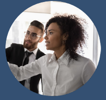
Refresh & lifecycle planning

Instead of managing multiple contracts and unpredictable costs, agencies benefit from one bundled payment that remains consistent year after year.