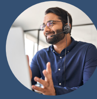
Maintenance & support